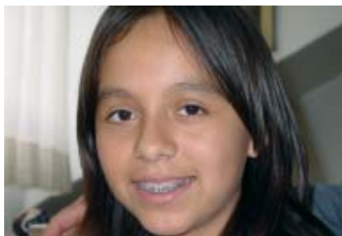
She doesn't know that she is an illegal alien

Europeans regard themselves as victims, drowned by a tide of immigrants. But is that the true picture? Is Europe really the victim, or do the demands for ridiculously cheap labour create a breeding ground for the hundreds of thousands who sneak in illegally every year? Is Europe a helpless victim or in fact creating the tide?